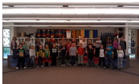
A first grade class traveled to the Hartford Senior Citizens Center to sing for the Thanksgiving dinner.